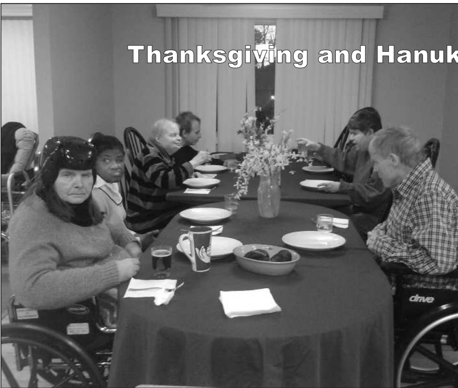
Thanksgiving and Hanukkah Celebrations