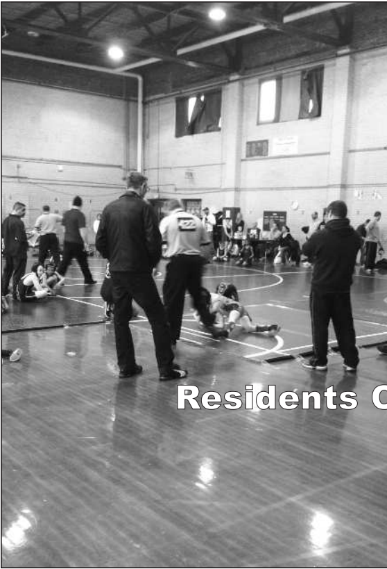
Residents Cheer Home Team Wrestlers