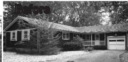
Above: AMIB's new Merion Avenue group home in Pine Beach before renovation