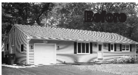
Above: AMIB's new group home on Midland Avenue in Pine Beach before renovation.

While the Borough of Pine Beach is beautiful in its own right, AMIB believes that it has made this little town a more attractive place by the renovations we have completed and in the way in which we have beautified these two properties.