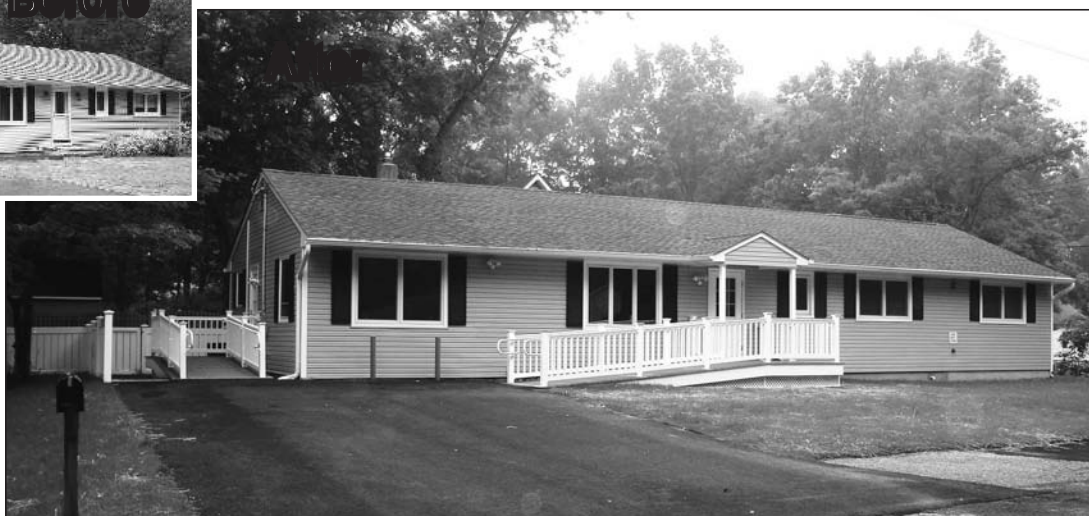
Right: Same home after renovation.